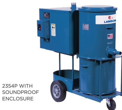
2354P WITH SOUNDPROOF ENCLOSURE